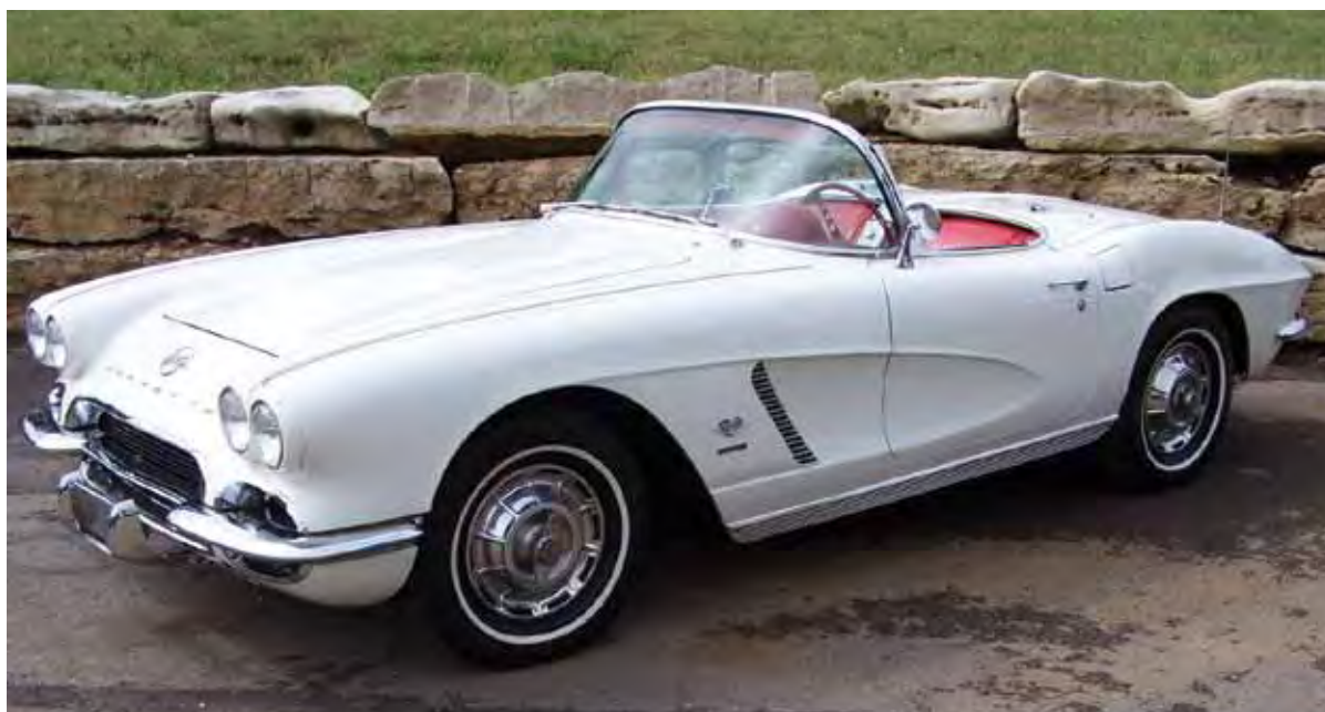
HUDGINS' 1962 CHEVROLET CORVETTE

Of the $88 million invested with Hudgins, $17 million was paid out to investors as purported profits. Hudgins lost at least $28 million trading unsuccessfully in futures markets, but