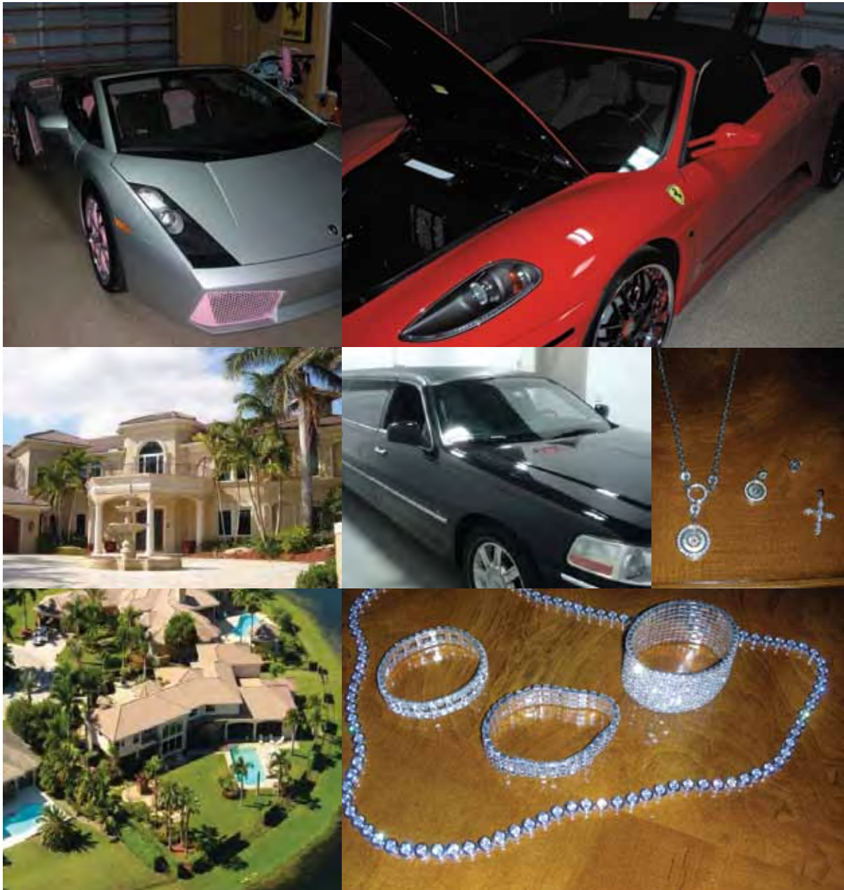
ASSETS HEAVILY PURCHASED WITH INVESTOR FUNDS: (TOP LEFT) LAMBORGHINI GALLARDO SPYDER, (TOP RIGHT) FERRARI 430 SPIDER, (CENTER) LINCOLN LIMOUSINE, (MIDDLE RIGHT, LOWER RIGHT) DIAMOND JEWELRY, (MIDDLE LEFT, LOWER LEFT) MANSION IN WESTON HILLS COUNTRY CLUB