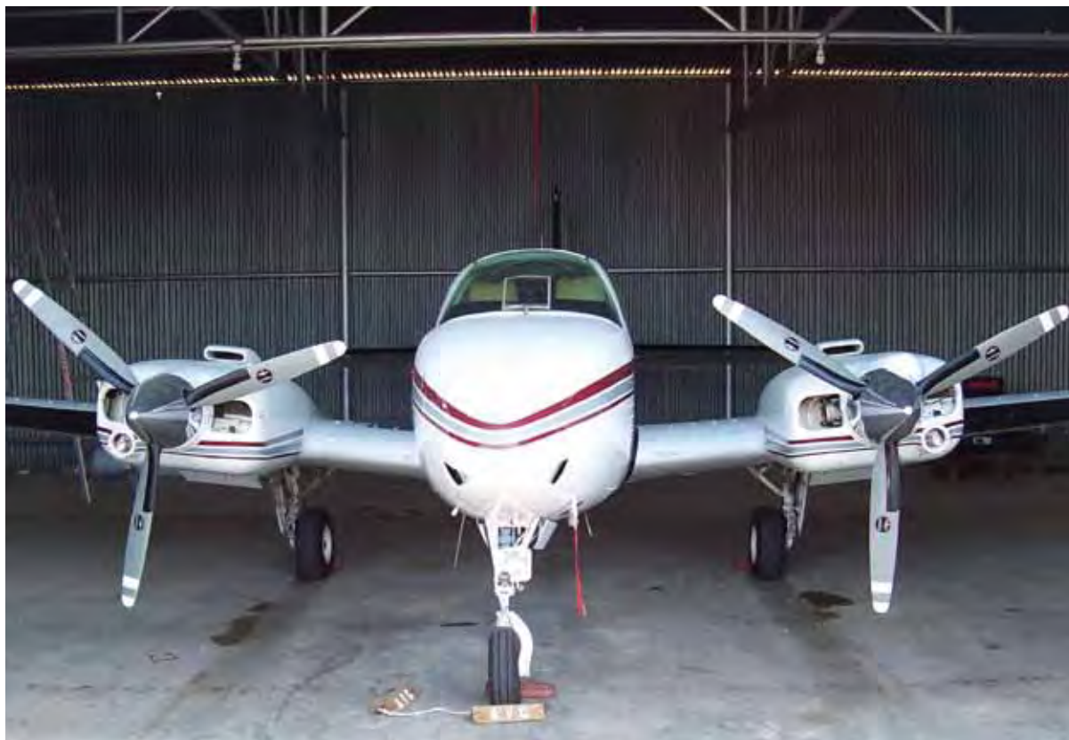
1985 BEECHCRAFT BARON AIRPLANE BOUGHT WITH INVESTOR MONEY