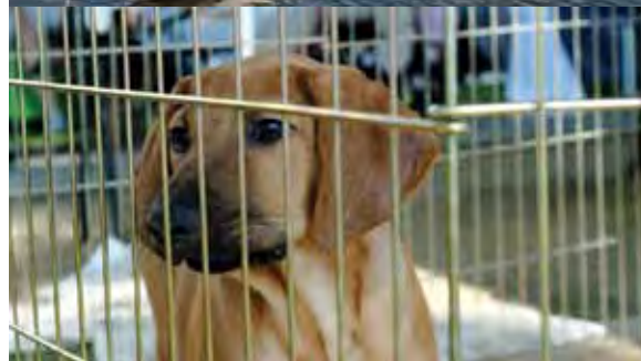
OSSIE SPENT INVESTOR FUNDS ON ITEMS LIKE A BMW, JEWELRY, BOATS, AND PET LODGING.