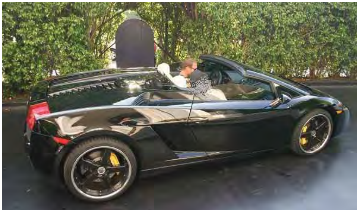
DIAMOND DRIVING HIS 2006 LAMBORGHINI

▼ CIVIL COMPLAINT – Legal document filed by wronged party to start a lawsuit against a wrongdoer